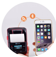
Easy Wireless Connection