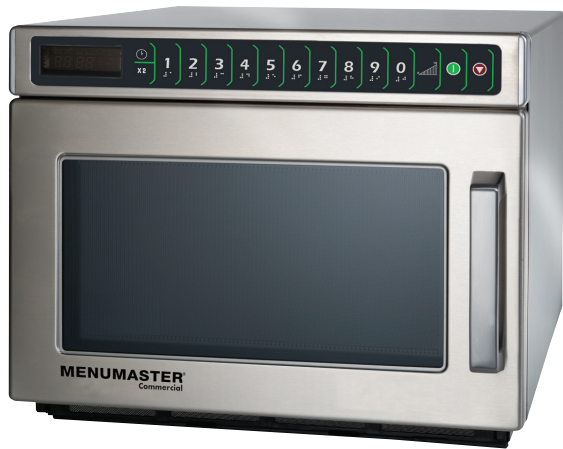
Model DEC14E2 shown