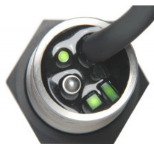
Potted sensor with "Teach" Button