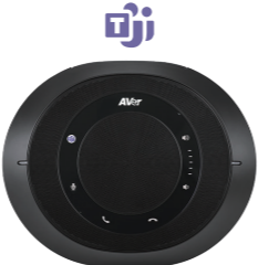
Microsoft Teams edition